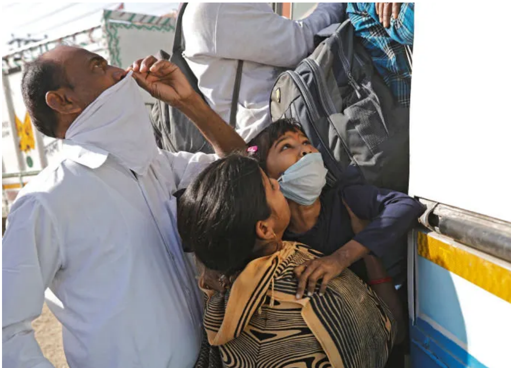
On the outskirts of New Delhi on March 29, a woman pushes her daughter on to an overcrowded bus as they attempt the journey back to their home village

The narcissism is deeply troubling. Perhaps one of the asanas could be a request-asana in which Modi requests the French prime minister to allow us to renege on the very troublesome Rafale fighter jet deal and use that €7.8bn for desperately needed emergency measures to support a few million hungry people. Surely the French will understand.