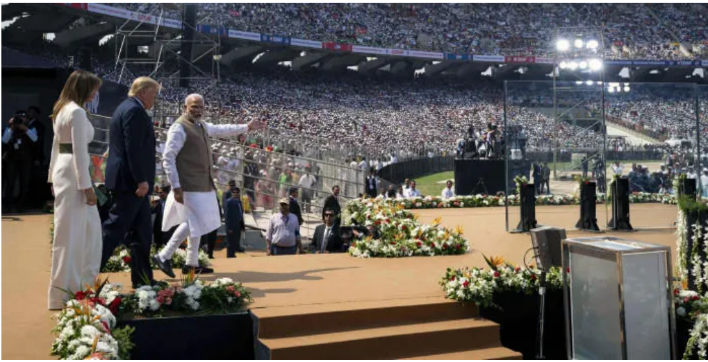
Narendra Modi with the US president and his wife Melania at a packed rally in Ahmedabad on February 24 — part of a lavish official visit

Night after night, from halfway across the world, some of us watch the New York governor's press briefings with a fascination that is hard to explain. We follow the statistics, and hear the stories of overwhelmed hospitals in the US, of underpaid, overworked nurses having to make masks out of garbage bin liners and old raincoats, risking everything to bring succour to the sick. About states being forced to bid against each other for ventilators, about doctors' dilemmas over which patient should get one and which left to die. And we think to ourselves, "My God! This is America! "