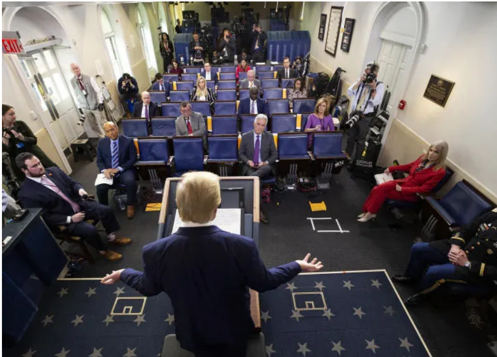
Donald Trump speaks about the coronavirus at a White House briefing on April 1, as the number of US cases topped 200,000

The mandarins who are managing this pandemic are fond of speaking of war. They don't even use war as a metaphor, they use it literally. But if it really were a war, then who would be better prepared than the US? If it were not masks and gloves that its frontline soldiers needed, but guns, smart bombs, bunker busters, submarines, fighter jets and nuclear bombs, would there be a shortage?