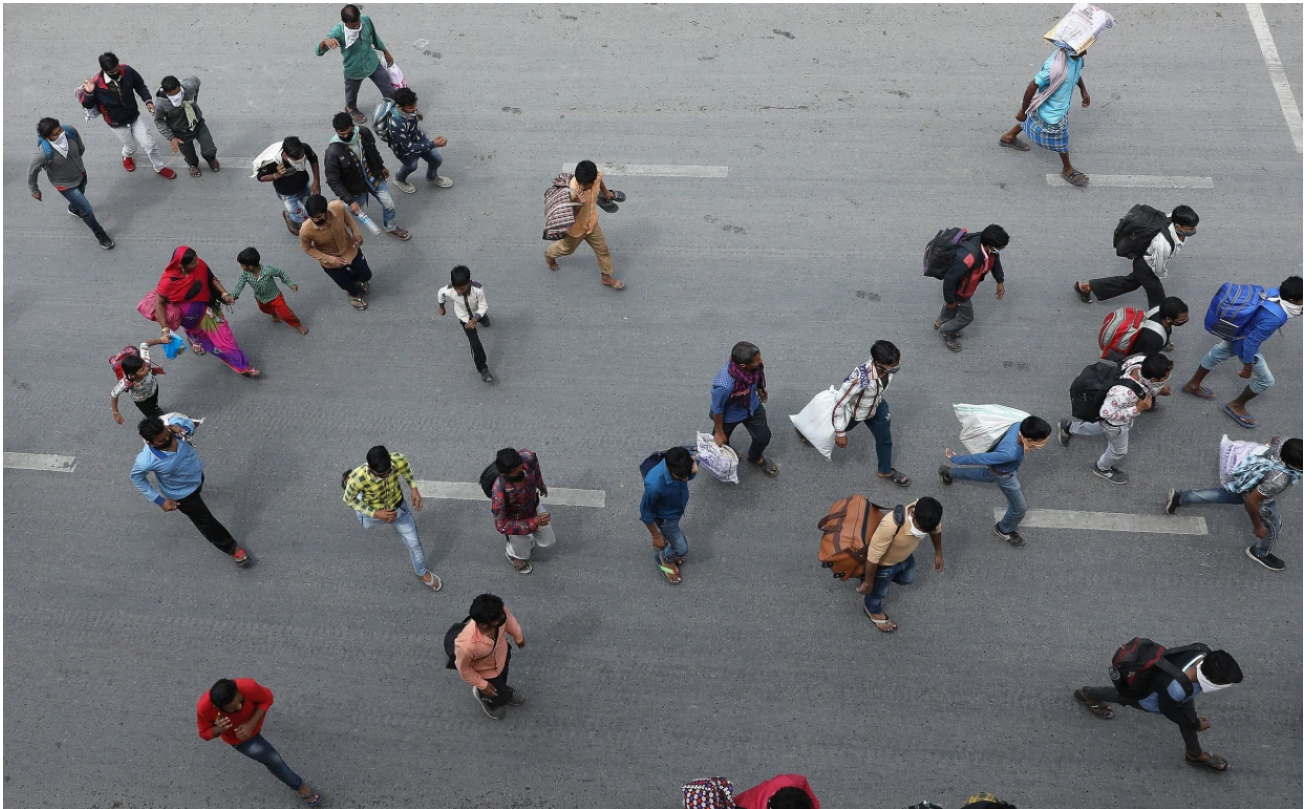
Migrant workers head towards a highway leading out of New Delhi, hoping to return to their home villages

When the walking began in Delhi, I used a press pass from a magazine I frequently write for to drive to Ghazipur, on the border between Delhi and Uttar Pradesh.