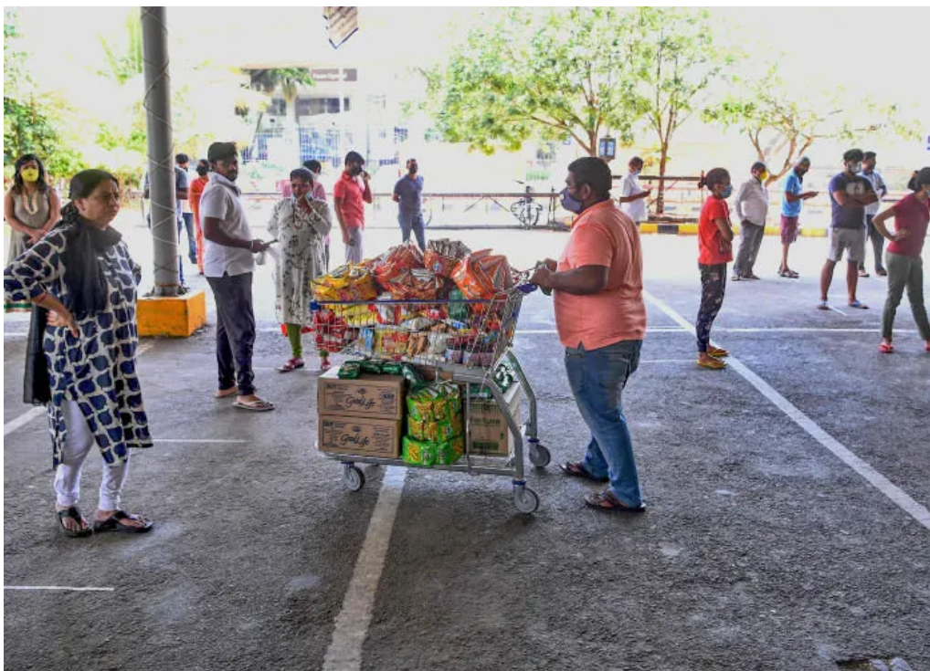
. . . while in Bangalore people queue to buy supplies at a supermarket

As an appalled world watched, India revealed herself in all her shame — her brutal, structural, social and economic inequality, her callous indifference to suffering.