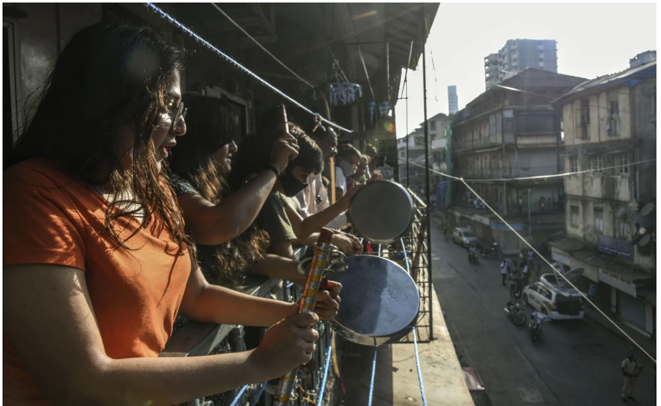
Women bang pots and pans to show their support for the emergency services dealing with the coronavirus outbreak

Thousands moved into refugee camps in local graveyards. Mutilated bodies were still being pulled out of the network of filthy, stinking drains when government officials had their first meeting about Covid-19 and most Indians first began to hear about the existence of something called hand sanitiser.