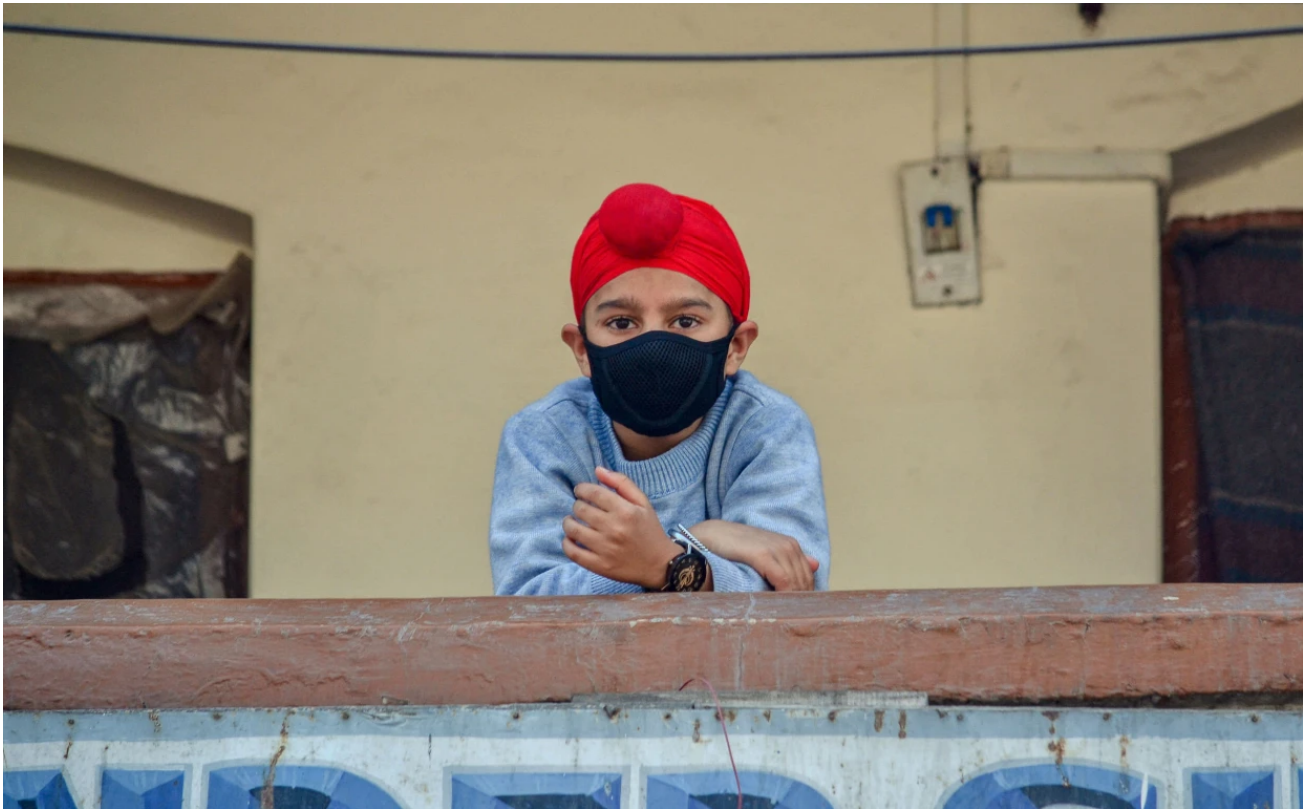
A boy wearing a protective mask ventures on to a balcony in Srinagar, which recorded Kashmir's first coronavirus death in late March

People will fall sick and die at home. We may never know their stories. They may not even become statistics. We can only hope that the studies that say the virus likes cold weather are correct (though other researchers have cast doubt on this). Never have a people longed so irrationally and so much for a burning, punishing Indian summer.