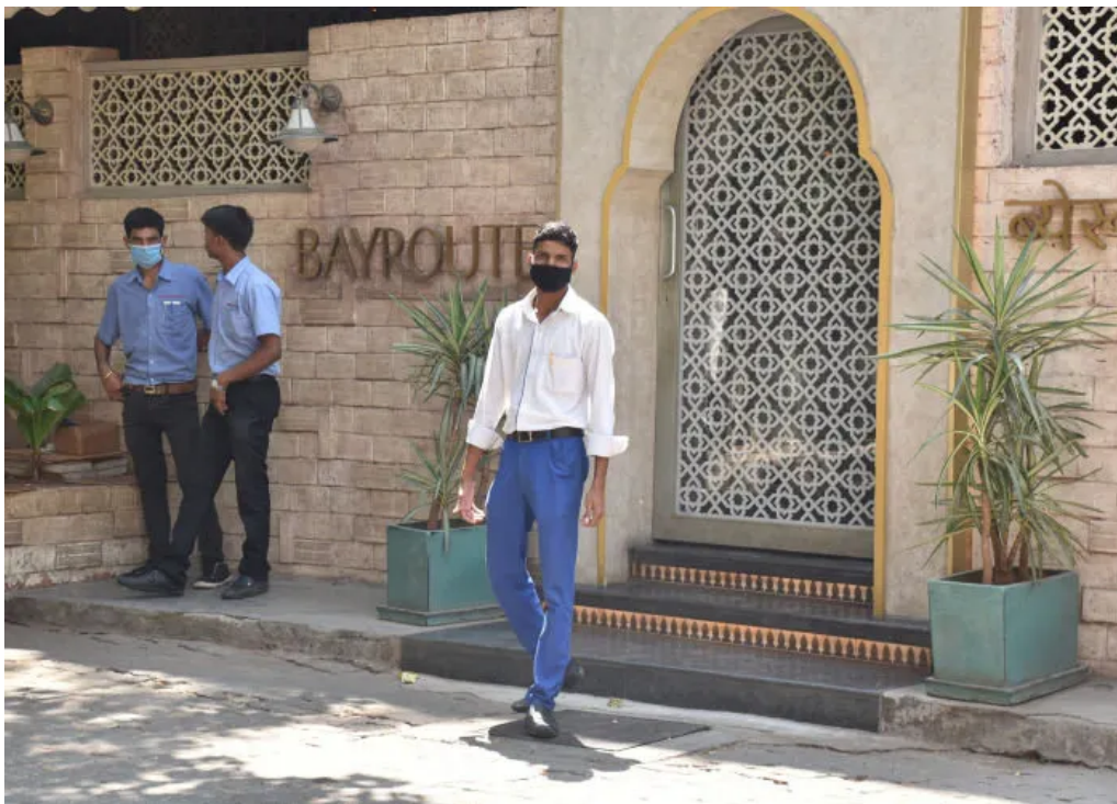
A resident wears a face mask in Mumbai, where the usually bustling streets are almost deserted. . .