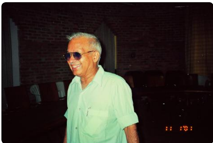
MP with his forever optimism