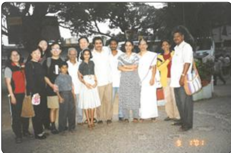
MP with a delegation of university professors from China, 2001.