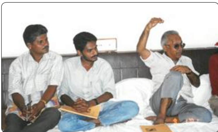
MP talking to a delegation from ARENA