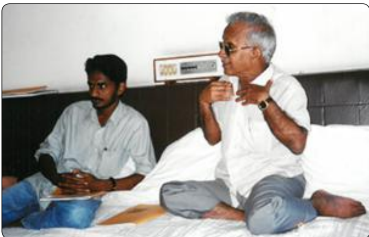
MP talking to a delegation from ARENA.