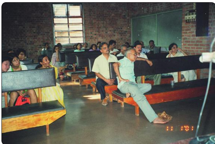
MP attending a seminar at CDS , Trivandrum