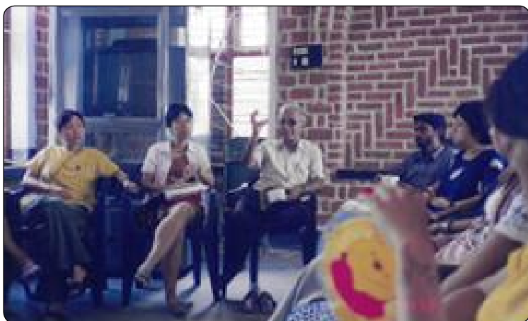
MP giving a talk to students from Hong Kong on a summer exchange programme