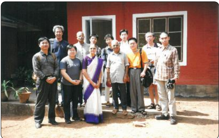
MP with a delegation of writers and editors from China