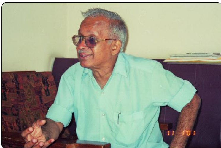
MP talking to a delegation from China, 2001