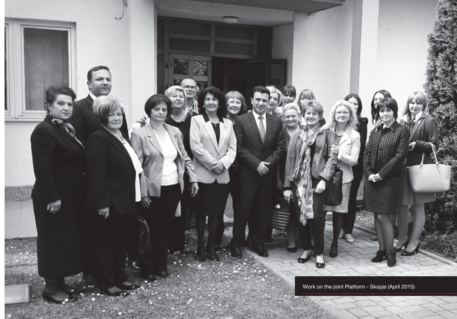
Work on the joint Platform - Skopje (April 2015)