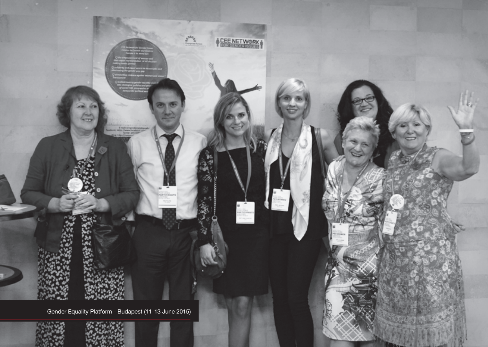
Gender Equality Platform - Budapest (11-13 June 2015)

be derailed, split and defragmented! We should deliberately and through targeted policies and action push for: