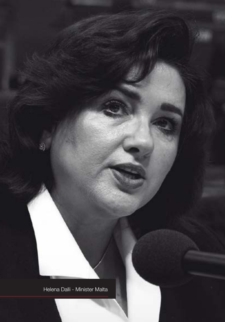
Helena Dalli - Minister Malta