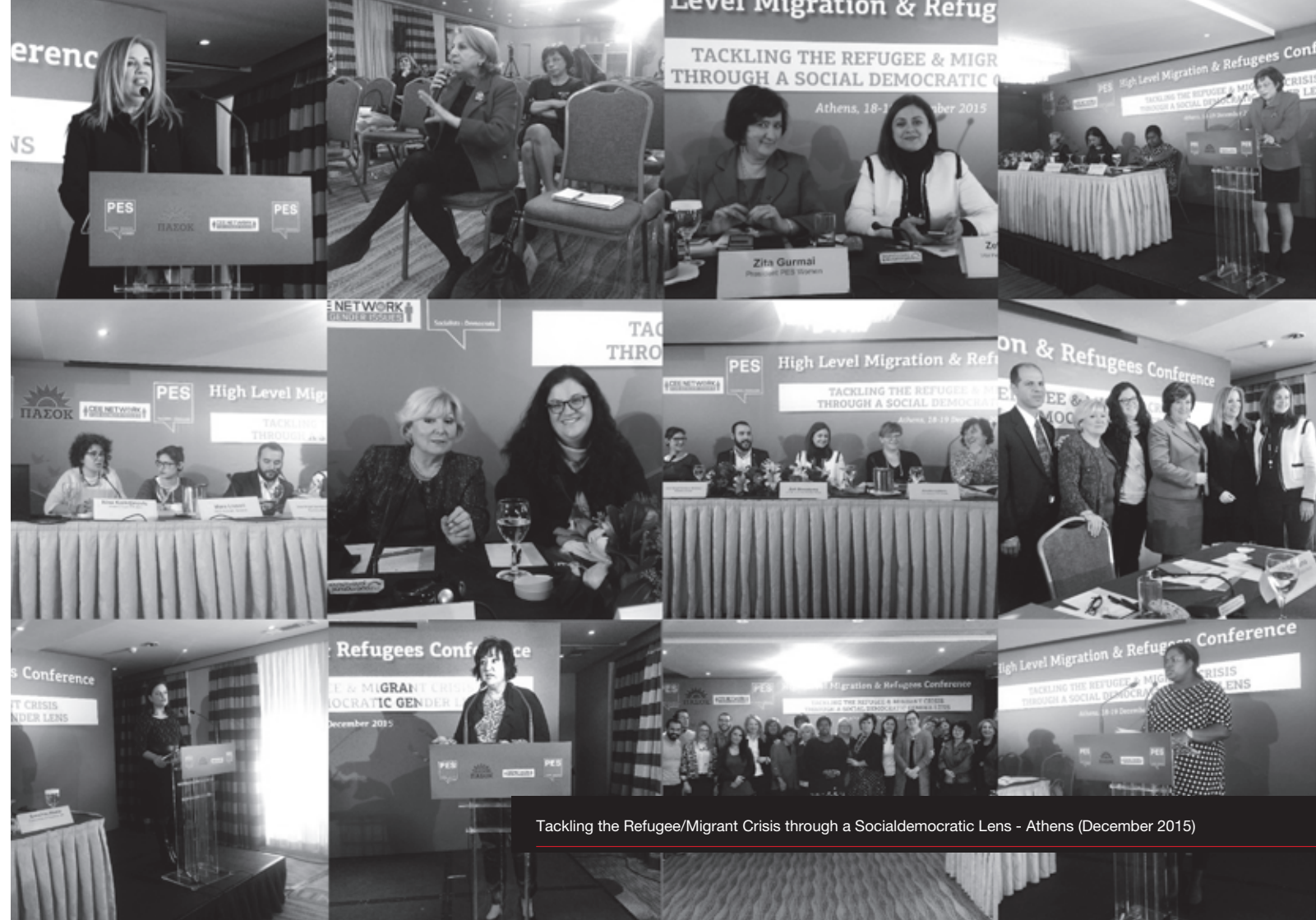
Tackling the Refugee/Migrant Crisis through a Socialdemocratic Lens - Athens (December 2015)

Political responses should rest on the principles of solidarity justice and equality, open societies and borders denouncing fear, xenophobia, racism, homophobia and right wing ideologies. Socialists, socialdemocrats and progressive should be clear in this respect, since combating such ideologies in our societies and even within our own ranks, has broader implications for the future of Europe. Socialist, socialdemocratic and progressive women stand ready to actively engage in finding humane, just, long term solutions to the different aspects of the refugee and migrant crisis and to support refugee women along this road.