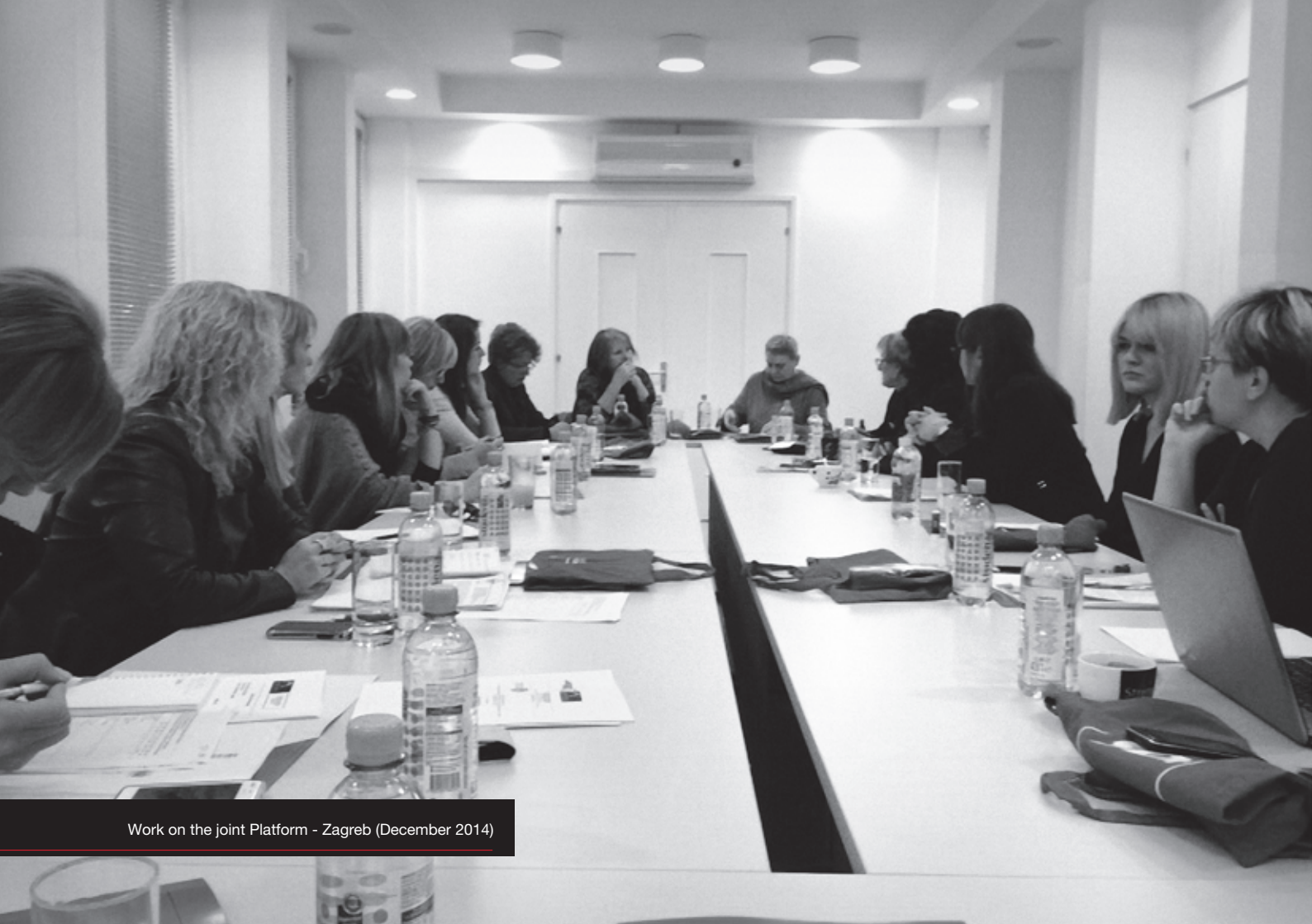
Work on the joint Platform - Zagreb (December 2014)