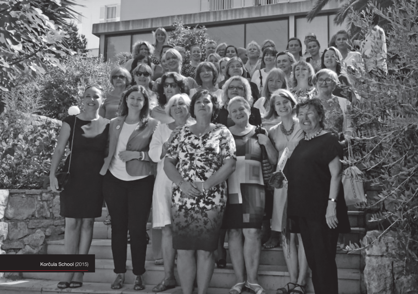
Korčula School (2015)

REPORT: “ TRANSFORMATIVE POLITICS - WOMEN IN POLITICS ”