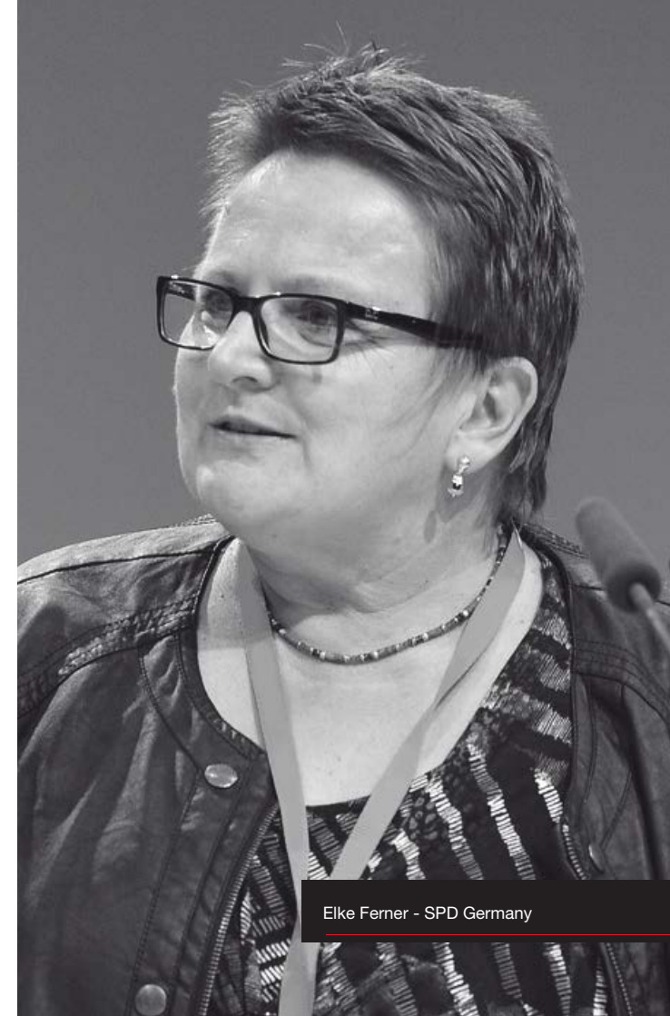
Elke Ferner - SPD Germany