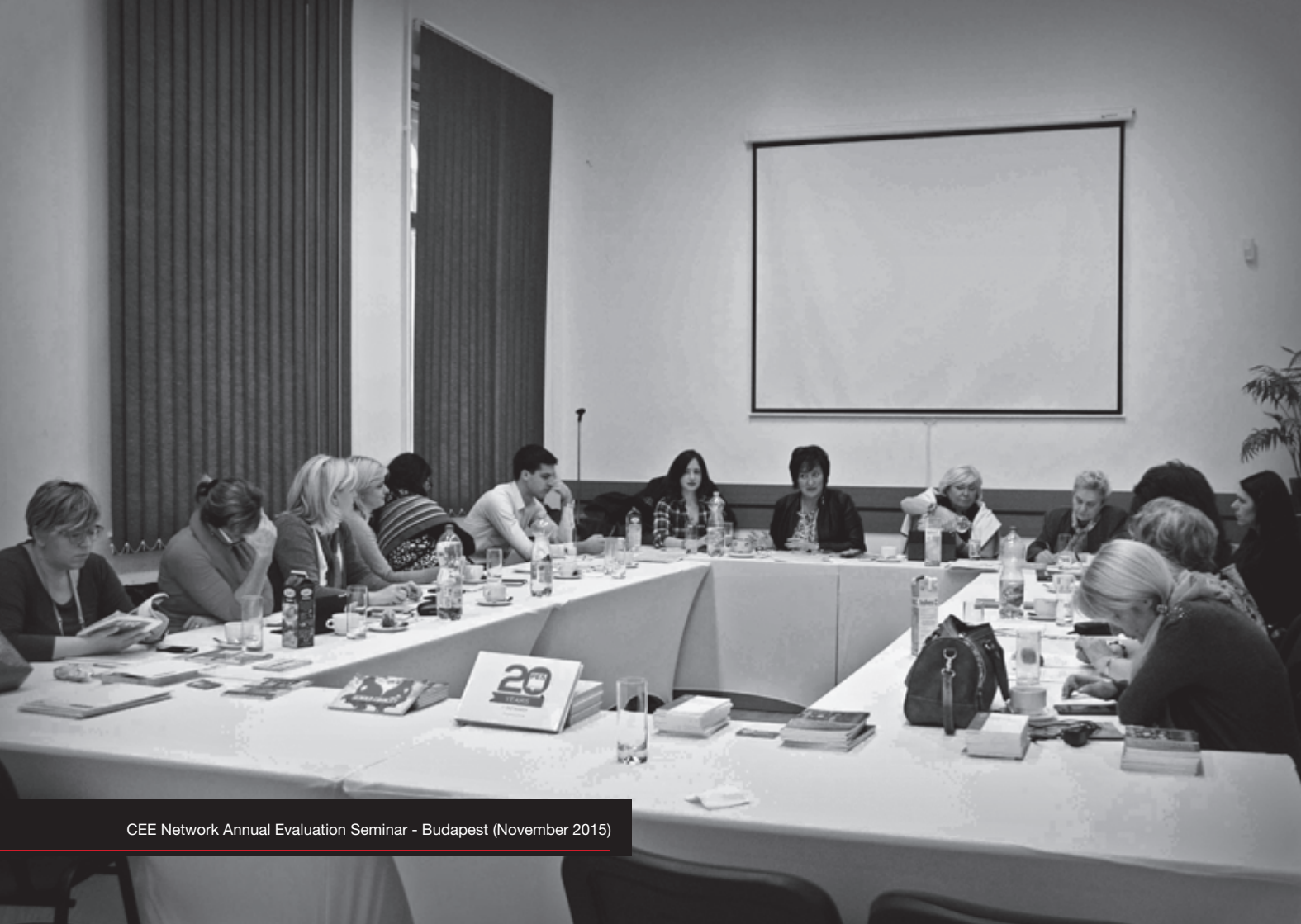
CEE Network Annual Evaluation Seminar - Budapest (November 2015)

The annual 2015 CEE Network Annual Evaluation Seminar was very well attended with presidents and representatives of women's forums from the region, CEE Network Board Members and representatives of the Party of European Socialists (PES), Party of European Socialists Women (PES Women) and Young European Socialists (YES). The Annual Evaluation Seminar was composed of two sessions: the first one took stock of and evaluated 2015 activities, the second one looked ahead to 2016 and had the purpose of establishing the workplan of the Network for the coming year, together with outlining some structural and functional developments.